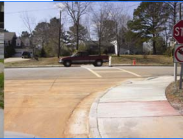
Example of wide curb radius