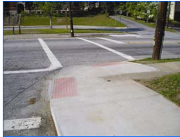
Example of tight curb radius